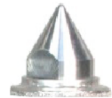
Cone Close End