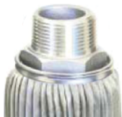
Threaded Open End