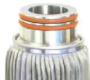
222 Open End