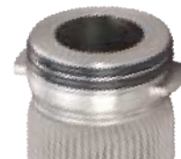
226 Open End